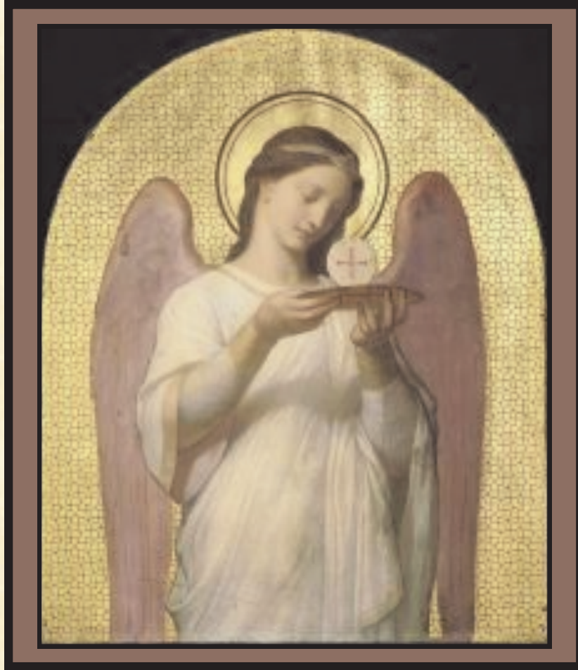
"Angel with Host" by Sebastien Melchior Cornu

5855 East W Avenue, PO BOX 264, Vicksburg, MI 49097 (269) 649-1629 St Vincent DePaul Ext 70 www.stmartinvicksburg.org